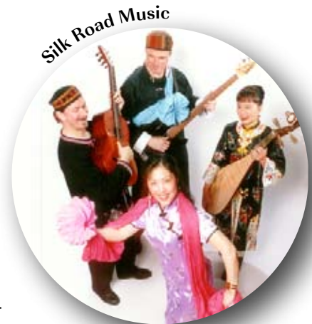
Silk Road Music

This event will offer a refreshing look at the Vancouver Chinese community.