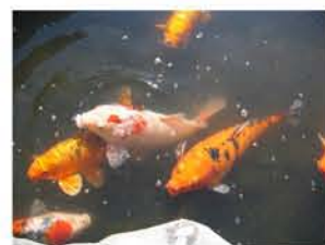
Koi-feeding, everyday at 11:45 am

Visit our website and check out the Activities Calendar!